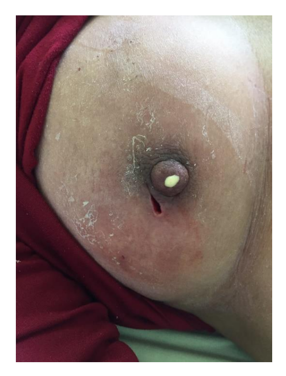
Figure 3. The milk lactated from right breast

staphylococcus aureus (MSSA). The pathology report confirmed acute mastitis. Under the diagnosis of right breast mastitis, she was given intravenous oxacillin 2 grams every six hours. However, with no obvious trauma or skin lesion was noted, mastitis caused by endogenous risk factor was suspected. To find out the reason of mastitis, medication review was done by pharmacist. The possible side effect of amisulpride was raised and prolactin level checked was suggested. Serum level of prolactin was confirmed high and stood at 111.49ng/ml (reference level: 2.74-19.64ng/ ml). New symptom of galactorrhoea was noted three days after the diagnosis of hyperprolactinemia (Figure. 3). A psychiatrist was consulted regarding medication adjustment to manage the raised level of serum prolactin. As per recommendation by psychiatrist, aripiprazole 5mg once daily was prescribed in combination with amisulpride. After 21 days of oxacillin treatment, there was a decrease in the amount of pus discharged from her right breast. The patient was discharged and followed-up at outpatient department. Prior to her discharged, her serum